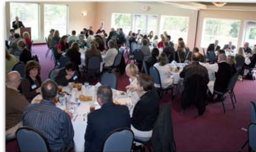
Monthly Luncheon Event