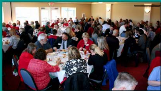
Above: Holiday Luncheon Event

The Chamber's Monthly Luncheon is always on the third Thursday of the month, from September to June. The Holiday Luncheon is a week earlier and is a special format.