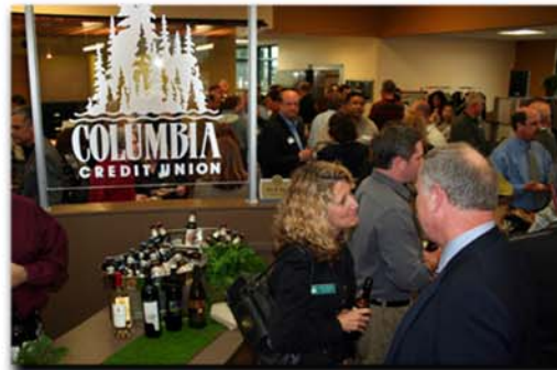
Business After Hours Networking Event

Membership in the Camas-Washougal Chamber of Commerce is the perfect way to network with local businesses and positively affect the community, where you live and work.